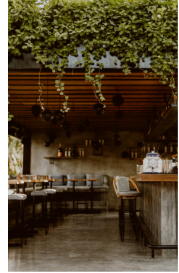
Faustos Coffee Shop | All-day menu

Whether you're here for a quick bite or a relaxing break, Fausto's Coffee Shop welcomes you with a cozy atmosphere, an all-day menu (Monday to Friday), and a curated selection of convenience items to enhance your stay.