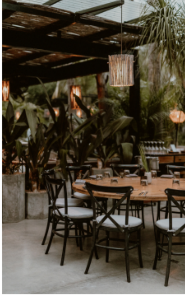
Acre Restaurant and Cocktail Bar

Taste it in our farm-to-table cuisine, a marriage of global influences and local ingredients that evolves with the seasons. Savor it in our innovative cocktail program, where award-winning compositions are elevated by produce grown just beyond the confines of the bar.